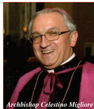
Archbishop Celestino Migliore

The Order of Malta in NYC was privileged to again have as the celebrant for the Mass honoring the Feast of St. John the Baptist, His Excellency Archbishop Celestino Migliore, the Papal Nuncio and the Vatican's Permanent Observer to the United Nations. Archbishop Migliore is also a Chaplain of the Order of Malta. We were particularly honored by the Archbishop's presence as, within a week thereafter, it was announced by the Vatican that Archbishop Migliore had been appointed as the Papal Nuncio to Poland. The Archbishop left NYC in July to take up his post in Warsaw.