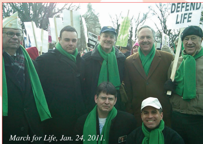
March for Life, Jan. 24, 2011.

headlines daily. There was a major pro-life and free speech victory on January 28th when a Federal District Court in Maryland issued a ruling striking down an ordinance passed by the City of Baltimore that would have required pregnancy centers to post signs stating that they did not make referrals for abortion or contraception. The Baltimore law was part of a national campaign by NARAL and other pro-abortion supporters to close down pro-life pregnancy centers. The NYC Council is proposing a similar bill in its Intro 371, which pro-life organizations are fighting, as in the Baltimore case, as a violation of the First Amendment free speech rights of the pregnancy centers. Pray that the Baltimore judicial decision will be a wake-up call to those promoting Intro 371 and visit http://www.gopetition.com/petition/41496.html to sign a petition opposing the NYC Council initiative.